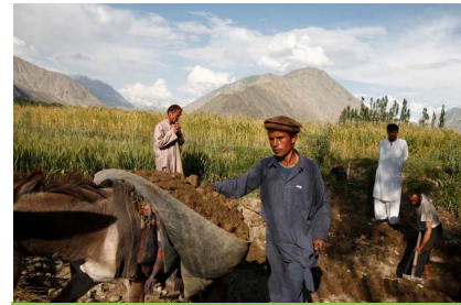
AGRICULTURE AND FOOD SECURITY