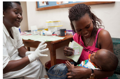
HEALTH AND NUTRITION