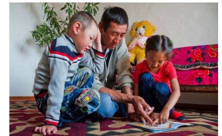
EARLY CHILDHOOD DEVELOPMENT